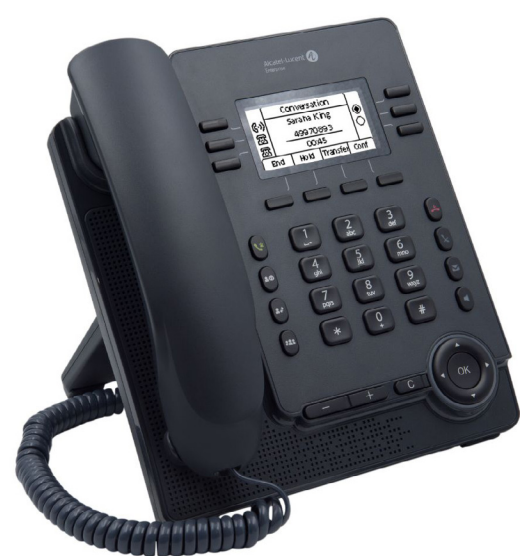
Alcatel Lucent M3