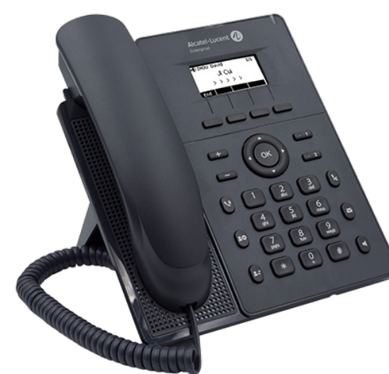
Alcatel Lucent H2P