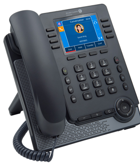
Alcatel Lucent M7