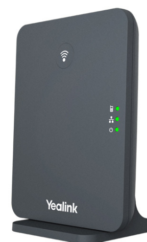
Yealink DECT IP Base Station W70B