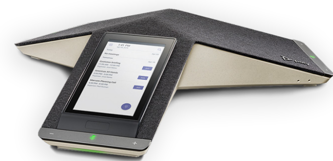
Poly Trio C60