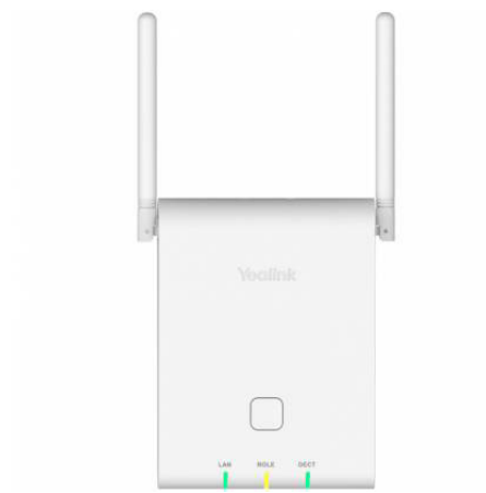
DECT IP Multi-Cell Base Station W90B