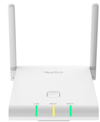
DECT IP Multi-Cell Base Station W90DM