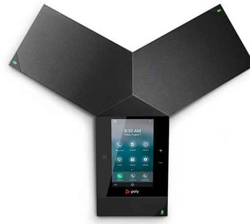
Poly Trio 8300 Conference Phone